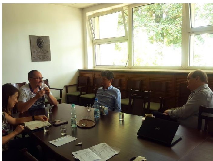
Meeting with CREATE Management team, 19 June 2018